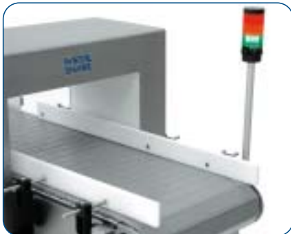
■ Tower Stack Lamp # 10100345, Tower stack lamp red/yellow/green # 10100333, Side rails, full length