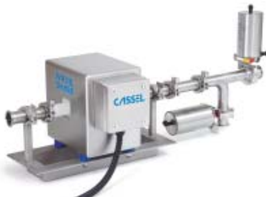
METAL SHARK® IN Liquid