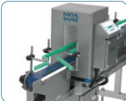
■ Bottle Conveyor JAR 1 # 10100129, HQ-GK conveyor with Intralox belt # 10100386, JAR 1 option for HQ as bottle conveyor