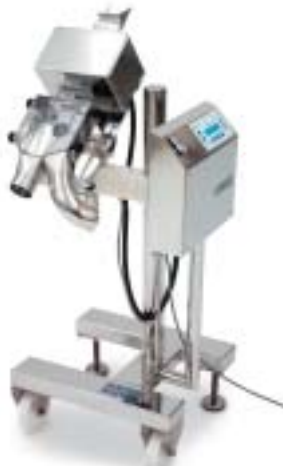
METAL SHARK® PH Pharma