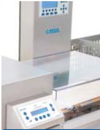
METAL SHARK® Checkweigher