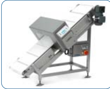
■ Inclining Conveyor with Tappets # 10105134, HQ-PU conveyor inclining # 10105140, Tappets on PU-belt

Get a general overview of our wide range of products, including different types of conveyors, conveyor belts, reject devices and other options . The individual choice of the components is based on the product type, dimensions of the product and its weight, packaging, belt speed as well as on other ambient conditions. For your specific demands we have the custom-made solutions on hand.