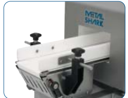
■ Knife Edge # 10100361, Knife edge