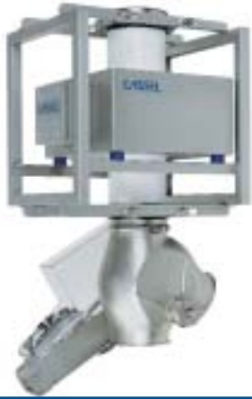
METAL SHARK® GF Gravity Feed