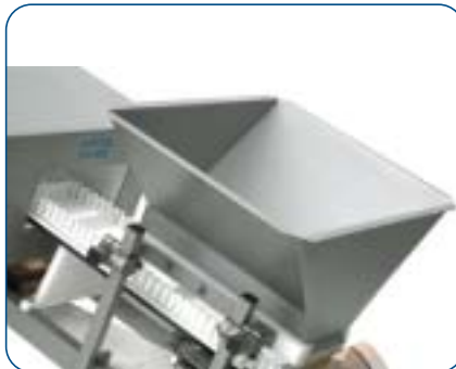
■ Inclining Conveyor with Flexowell Wavy Edge # 10100502, Flexible conveyor belt with wavy edge # 10105140, Tappets on PU-belt # 10105001, In feed hopper with castors