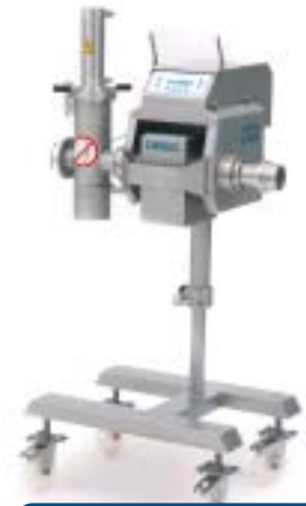
METAL SHARK® IN MEAT