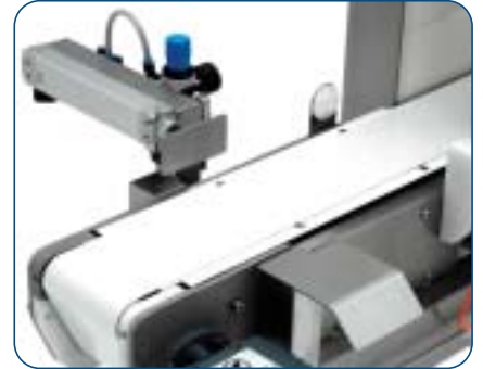
■ Transversal Pusher TP with PU-Belt # 10100314, Pusher TP transversal # 10100318, Photo gate reject trigger # 10100322, Reject chute