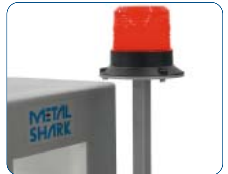
■ Flash Light # 10100346, Xenon flash light, red # 10100347, Tripod for xenon flash light