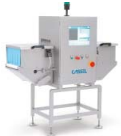
METAL SHARK® X-Ray