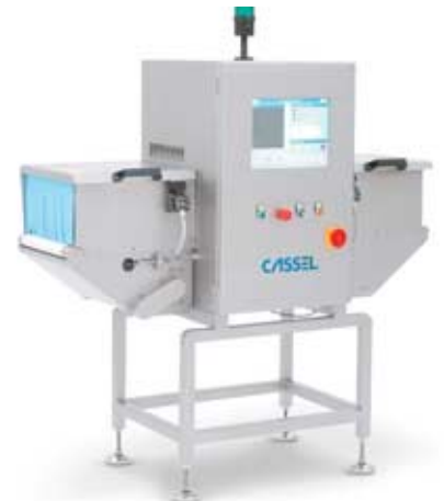
METAL SHARK® X-Ray