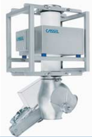
METAL SHARK® GF Gravity Feed