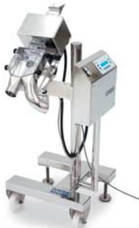
METAL SHARK® PH Pharma