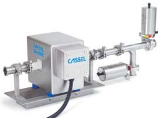
METAL SHARK® IN Liquid