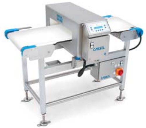
METAL SHARK® HW