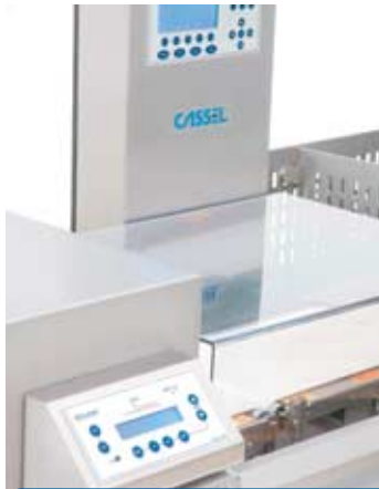
METAL SHARK® Checkweigher