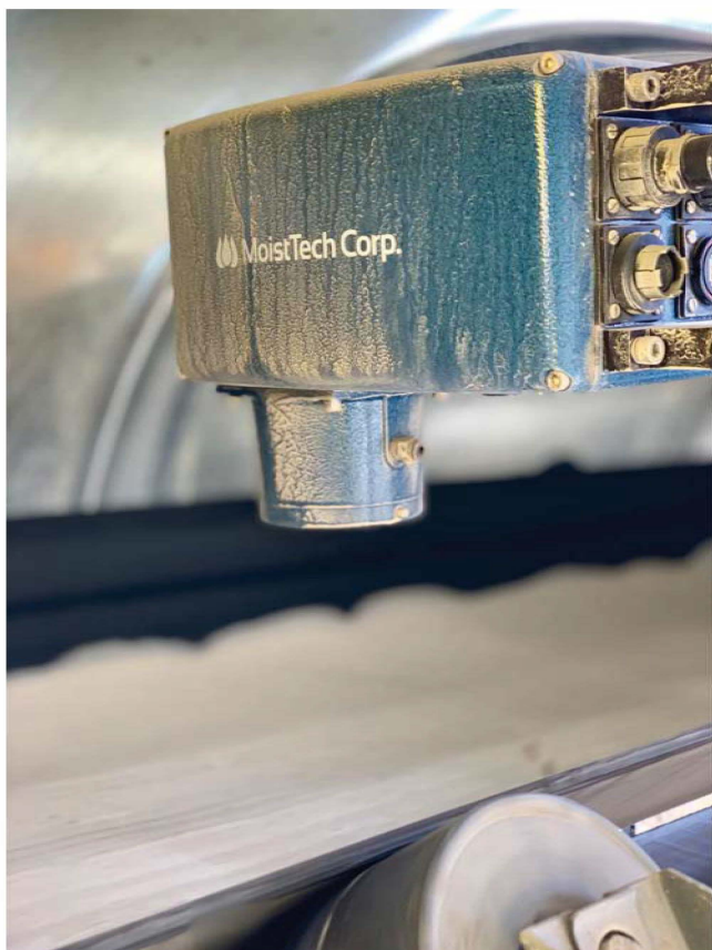
Measuring moisture in sand

Moisture measurement is extremely important during mineral processing from mining to the final product. Moisture measurement is critical in all aspects of the mining process. Thus, mining companies are constantly adjusting moisture to maintain the quality of their product. Testing moisture content throughout the process also provides